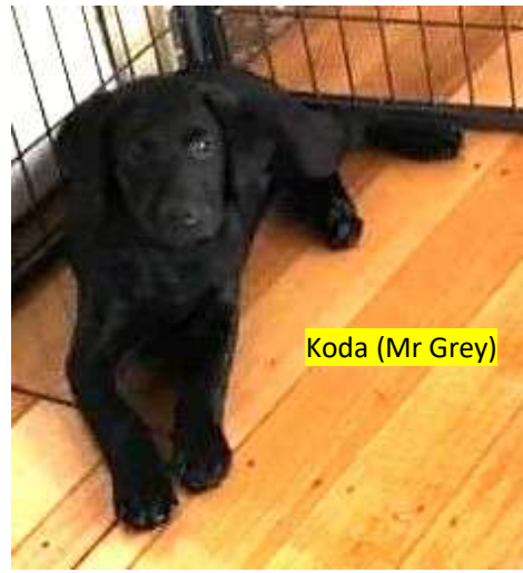
Koda (Mr Grey)