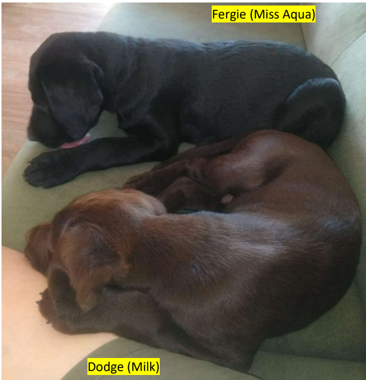
Fergie (Miss Aqua)