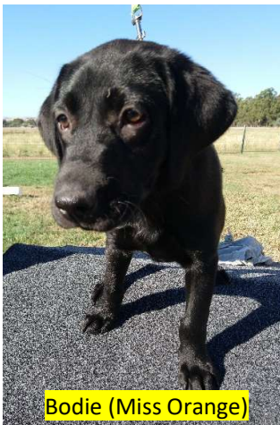
Bodie (Miss Orange)